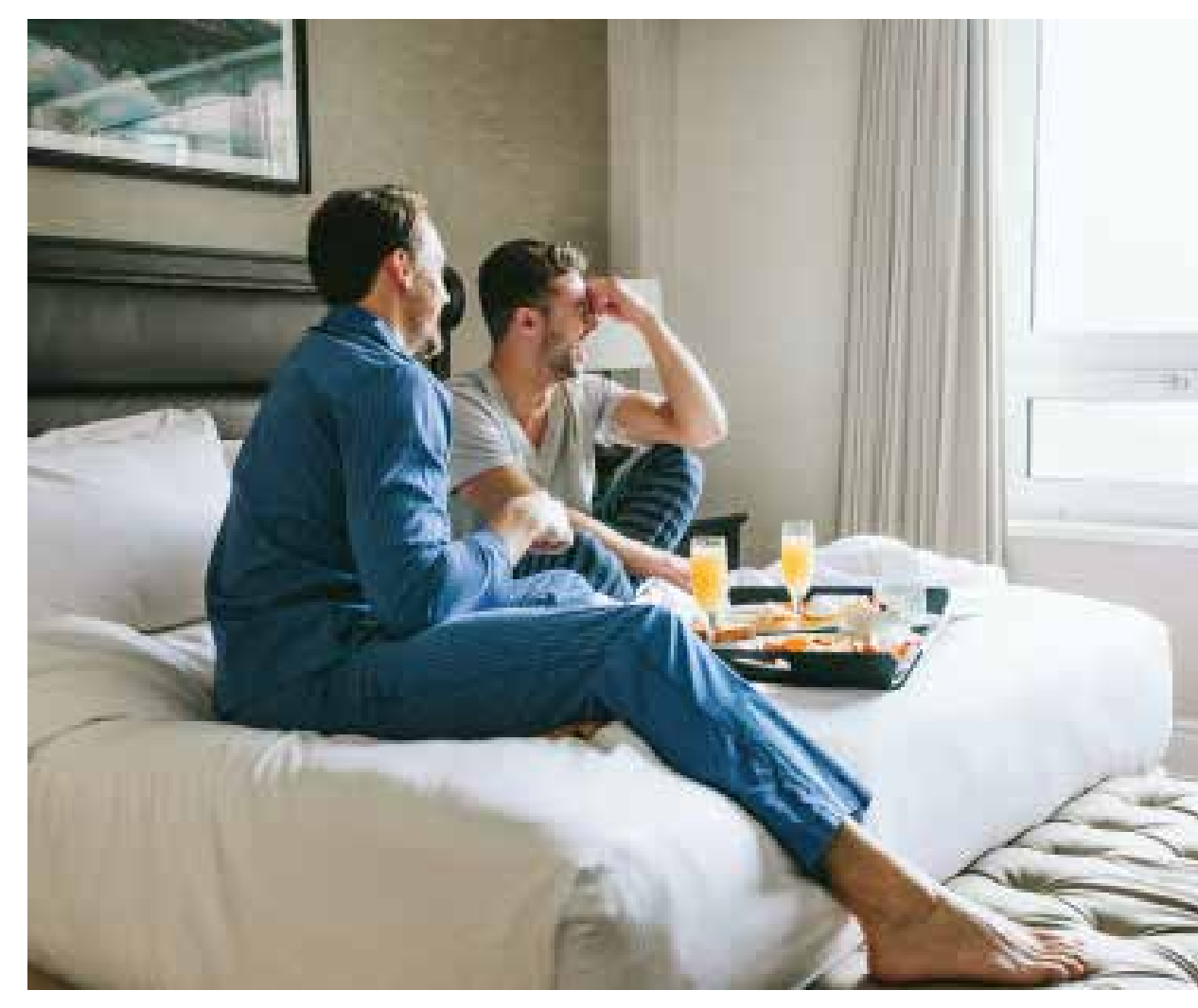
WE HAVE GREAT TASTE

Email | <u>BSH.RoomServiceCashiers@Fairmont.com</u> Phone | 403 762 1704