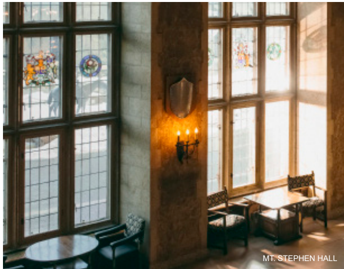
MT. STEPHEN HALL